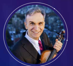
GIL SHAHAM VIOLIN USA