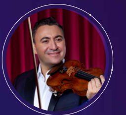
MAXIM VENEROV VIOLIN MONACO