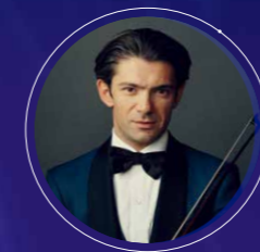
GAUTIER CAPUÇON CELLO FRANCE