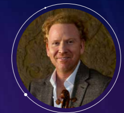
DANIEL HOPE VIOLIN IRELAND