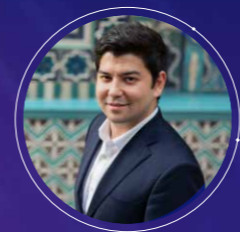
BEHZOD ABDURAIMOV PIANO UZBEKISTAN