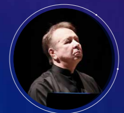
MIKHAIL PLETNEV PIANO SWITZERLAND